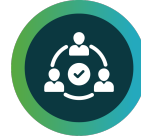
Unnecessary and Inconsistent Approvals