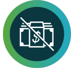
High-Level Managers Performing Non-Value-Added Work