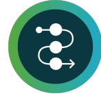
Redundant and Manual Processes

We recommended our client pursue a more efficient service delivery model, and we made sure to back up that recommendation with the quantitative data as well as the anecdotal information we collected.