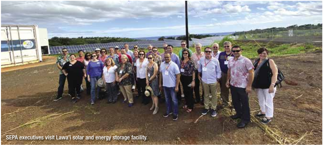
SEPA executives visit Lawa'i solar and energy storage facility.

During the blackouts, KIUC immediately sent out regular Facebook and radio announcements to keep customers updated on restoration status and encourage energy conservation. The co-op's members remained engaged and appreciative of the updates during and after the event.