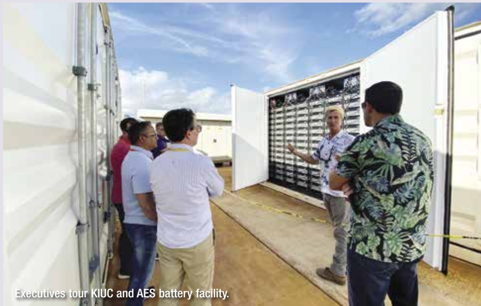
Executives tour KIUC and AES battery facility.