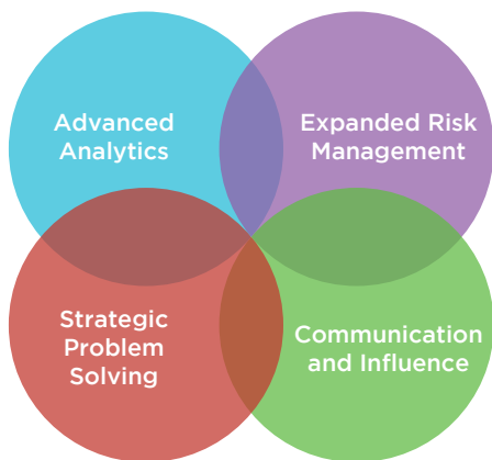
Figure 1: Four Key Skills for Future Finance Professionals

In this article, we examine what's driving the evolution of the finance skillset and four key skills that are important for future finance professionals: advanced analytics, expanded risk management, strategic problem solving, and communication and influence (see Figure 1).