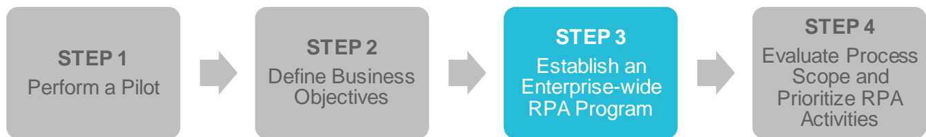
Figure 1: Enterprise-wide RPA Program Four-Step Approach

Three primary models of governance have emerged to oversee established RPA programs (see Figure 2). While these models typically originate with RPA programs, they may also be expanded to govern other IA deployments (e.g., virtual agent and artificial intelligence applications). The best model for an organization is highly dependent on its culture and how your company wants to make technology-related decisions. Evaluating approaches provides an opportunity to test new governance models and ensure effective decision-making for future technology decisions.