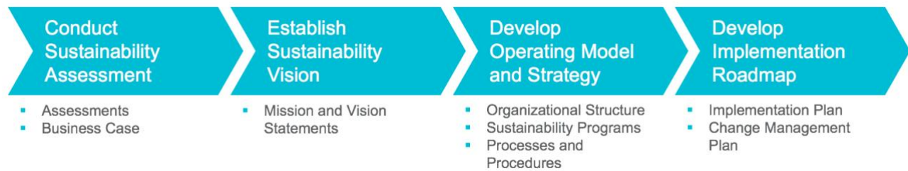
Figure 2: Sustainability-Driven Organizational Transformation

As you begin the implementation of your sustainability-driven organizational transformation, it will be necessary to monitor and track the performance of your strategic objectives. It is critical to establish channels of continuous two-way observation and review to ensure the transition is progressing as expected. Some of the key activities to ensure a successful implementation include: